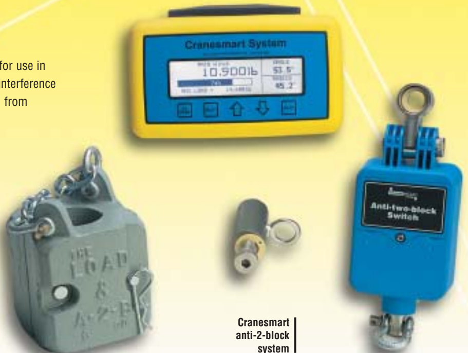
Cranesmart anti-2-block system

Our products meet or exceed the requirements set forth by ABS, ANSI, API, ASME, CALOSHA, City of New York, CSA, DNV, FCC, OSHA, SAE, U.S. Army Corps of Engineers, U.S. Coast Guard, UL, U.S. Navy, and others.